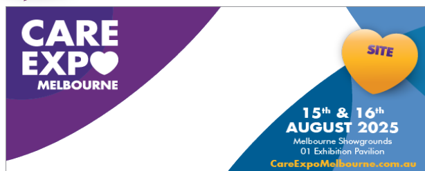
Email Signature Template 1