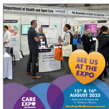
Social Media Post 1