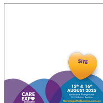
Social Media Post Template 1