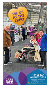
Social Media Story