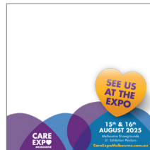
Social Media Post Template 2