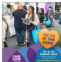
Social Media Post 2