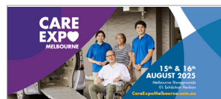
Facebook Cover 2