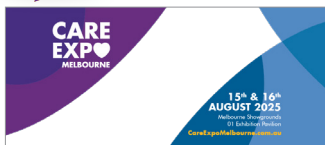
Facebook Cover Template 1